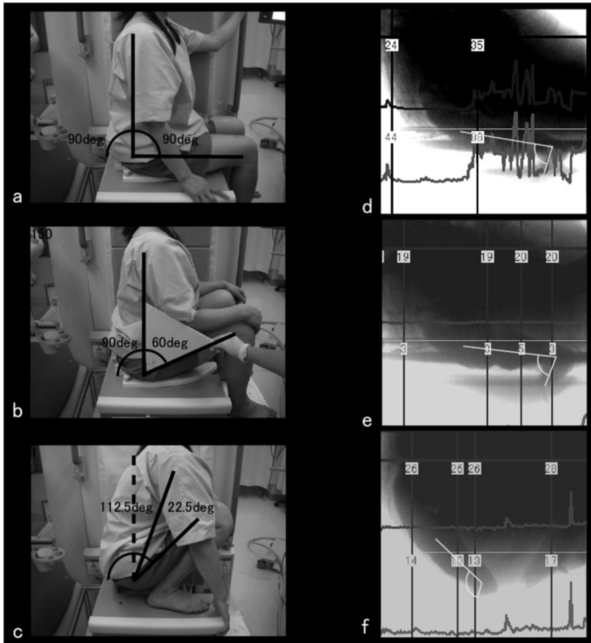
Fig. 1 Three positions on defecation and video imaging. A typical recording of a subject (case 1) is shown. Left column shows body positions (a, sitting; b, sitting with the hip flexed; c, squatting with the hip most flexed). Right column indicates the anorectal angle on defecation according to the body position in the left column. The anorectal angle was measured radiographically in a lateral view using two central longitudinal axes of the rectum and the anal canal, respectively, which lie in the center of two wall lines. The anorectal angle on defecation became larger with squatting (c,f) than with sitting (a,d), and also larger than with sitting with the hip flexed (b,e). Pressure values are not indicated here.

defecation simultaneously using anorectal videomanometry in six healthy volunteers. Here, demonstrated that the rectoanal angle was larger and abdominal pressure lower with squatting as compared to the corresponding values obtained for defecation while sitting.